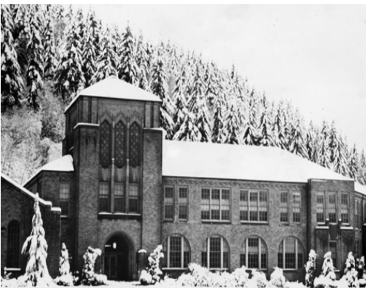
The Campus School in Winter, 1950

What a year 2007 has been! The exhibit, the reunion, the scholarship and memorabilia preservation funds, the video...wow!. Thank you from the bottom of our hearts for your commitment, generosity, and, most of all, your friendship.