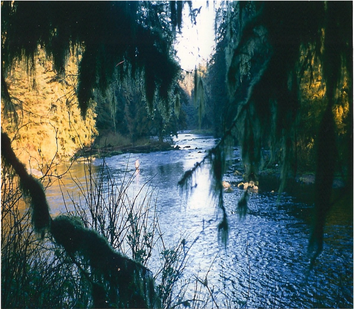
Southeast Alaska spring steelhead water

What can a man desire more when standing knee-deep in a mountain river, rod in hand, with trout on the rise? Here he has earth and air and sky before him, strangely interfused and woven into one element. The brook runs over the bones of the planet and carries the sky on its back, so that one who gazes into this crystal long and steadily will find there not food and drink only but work and play, patience and excitement, knowledge and wisdom, fact and dream.