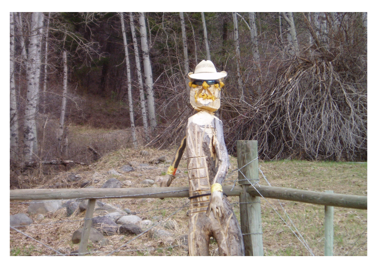
Annotations by Paul Ford

What caused the artist to produce such an extremely expensive deluxe limited edition? What would the market have been in 2000? Perhaps anglers who were art collectors? Or did Ms. Timkin care? One can only speculate.