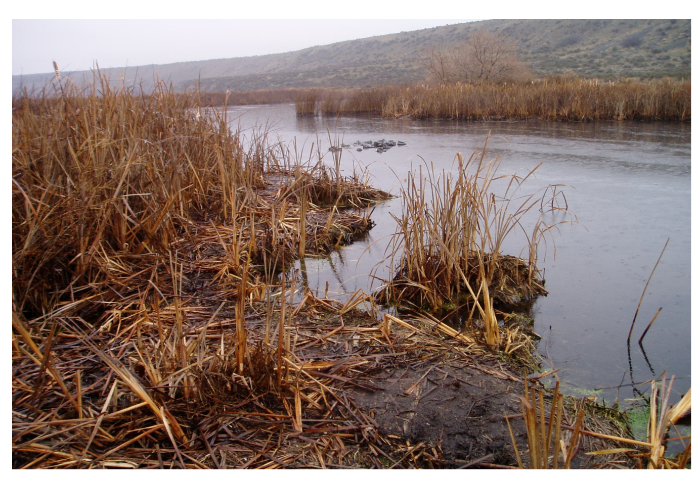
Rocky Ford Creek