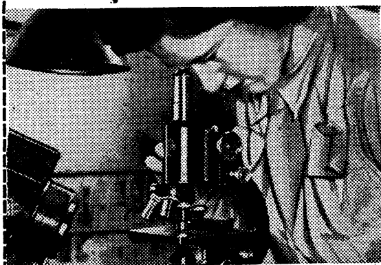
WAAC Laboratory Technician